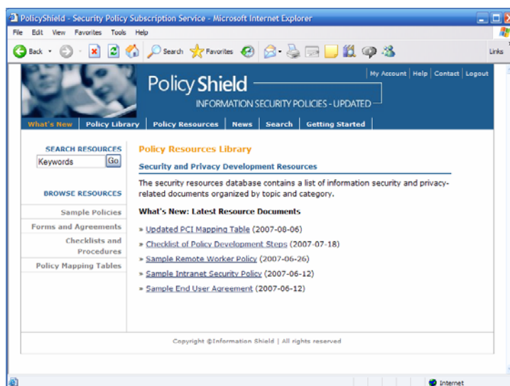
The PolicyShield web-based application interface allows easy navigation and quick searching.

Copyright © 2007-2008, Information Shield, Inc.